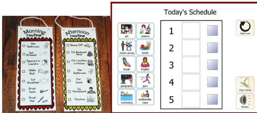
Image on left: https://whereimaginationgrows.com/visual-routines-empower-preschoolers-morning/

Image on right: https://www.pinterest.com/pin/355432595583719583/