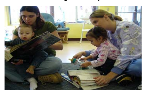
Children enjoying wall paper and fabric sample books

Wallpaper/Fabric Sample books are made from old sample books by gluing objects, pictures, and text on each page. These books are heavy enough to remain stable for ease in page turning and hold up to much moisture and rough usage. The colors and textures are interesting to many children.