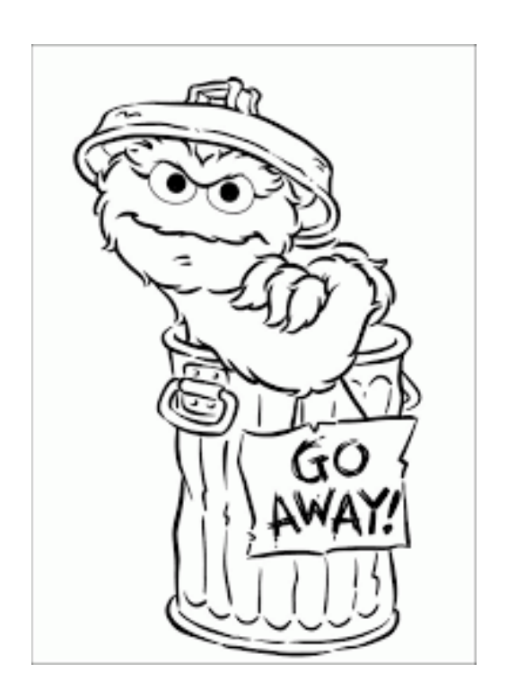
*coloring page