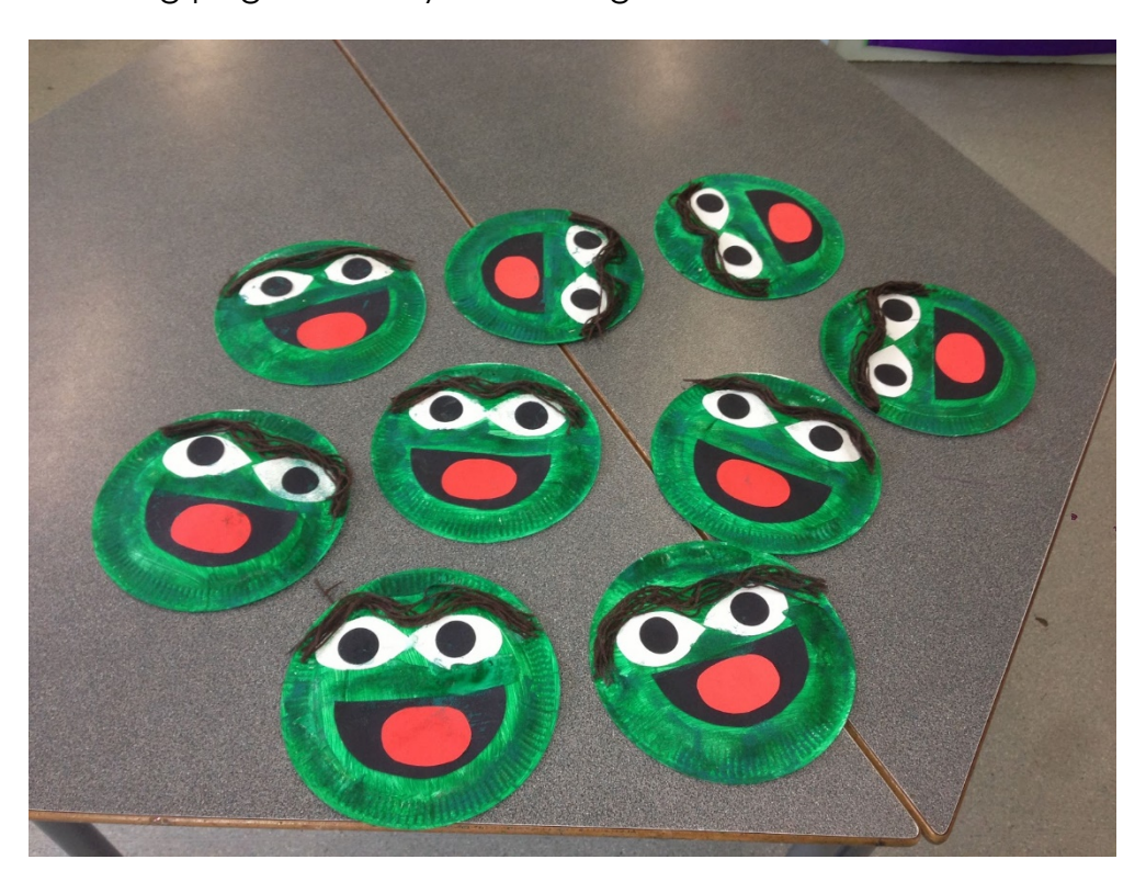
*project courtesy of Lisa Watkins